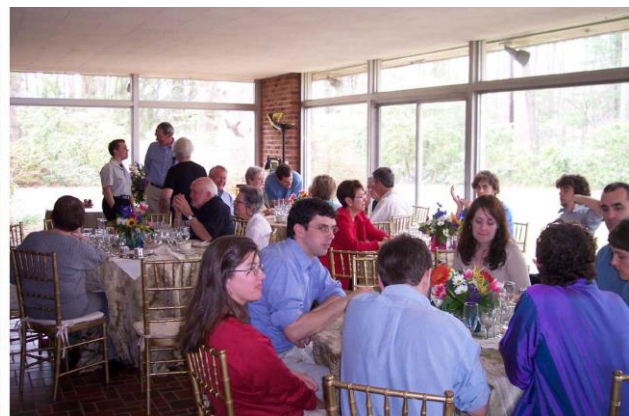
Catered Banquet in the Garden Room / Porch