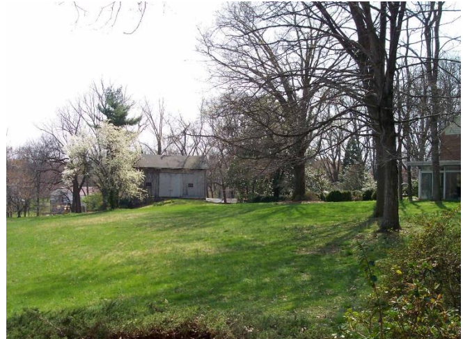
The Meadow and Old Barn

Public input opportunity has been lacking; requests for an open meeting have been unanswered.