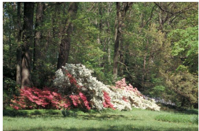
Azalea Border from the Glass Porch /Garden Room