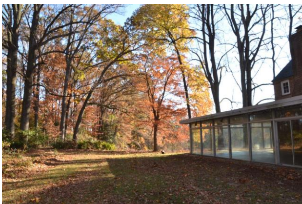
Autumn Vista and the Glass Porch/Garden Room