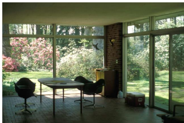
Rhododendrons Viewed from the Garden Room