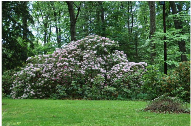
Rhododendron 'Cadis' as Viewed from the Garden Room