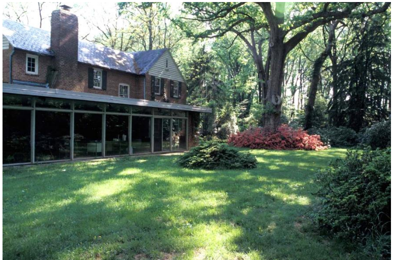
The White Residence and the 956 Glass Enclosed Porch