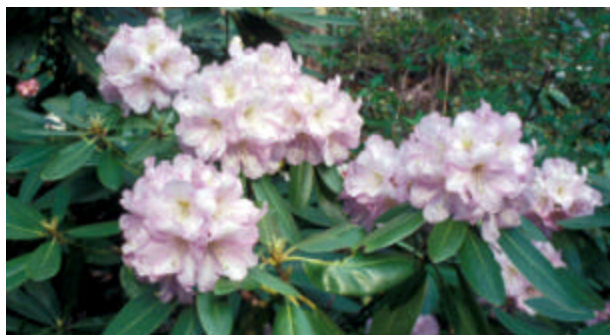
‘Mary K’ – Pale Lavender Pink