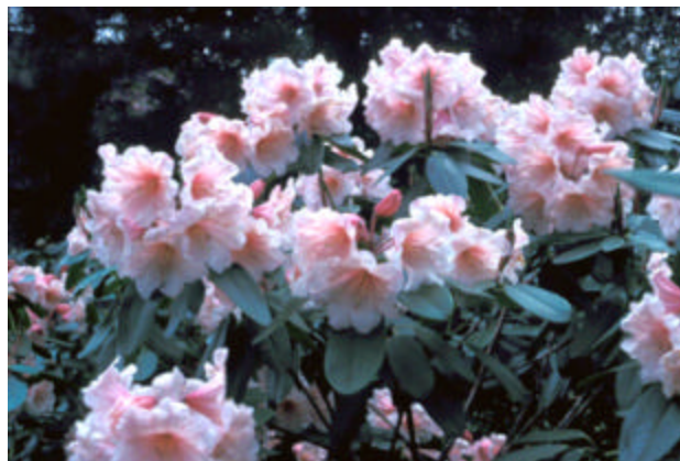
‘Mount Siga’ in the Gable Garden