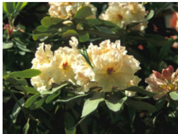
‘James Allison’ – Cream with red blotch