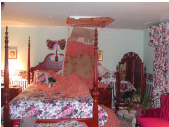
Tree Damage in the McWhorter's Bedroom

In a strong storm on November 16, some large branches came down on the roof of the McWhorter's home in Gambrills, MD. Fortunately, Bob and Rosa were not at home since one branch pierced the roof over their bedroom and heavy rains caused the ceiling to collapse. Water also damaged the ceiling in the living room located on the floor below.