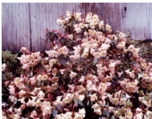
'Mary Garrison' at Gable's Barn