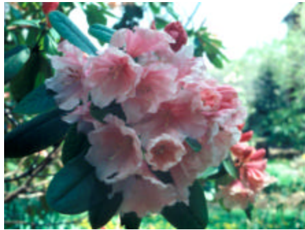
Peach Pink Seedling: 'Dr. Rock'