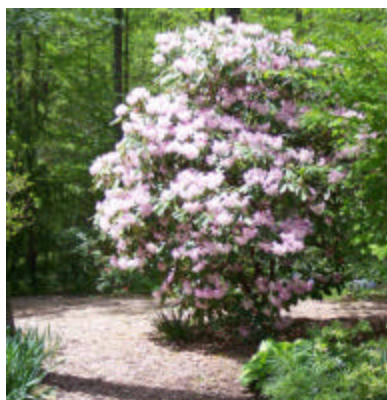
‘Katherine Dalton’ in the Beaudry Garden