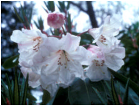
The Seed Parent: R. houlstonii