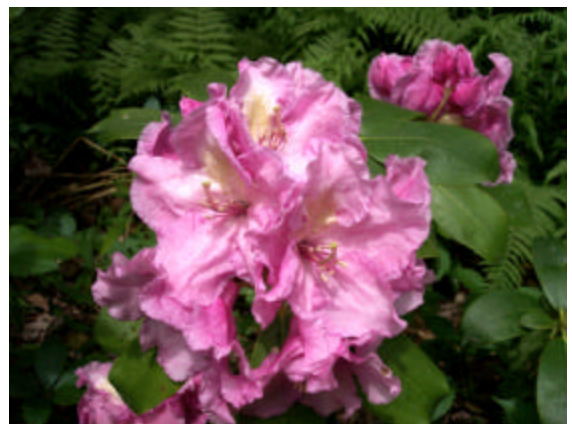
'Fair Isle' - Ruffled light pink