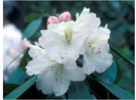
Blush Pink Sister: 'Shell'