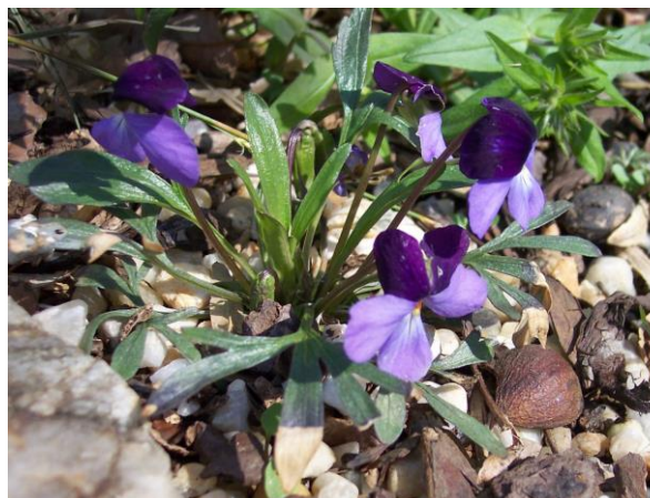
Birdfoot Violet ( Viola pedata )

native birdfoot violets ( Viola pedata ), a very difficult wildflower for me to grow. They seemed to naturalize in the garden, especially along the paths. They have larger blossoms than most violets and cut-leaf foliage. Some plants have solid blue flowers but others can be bicolor with the two upper petals in dark purple and look like small pansies.