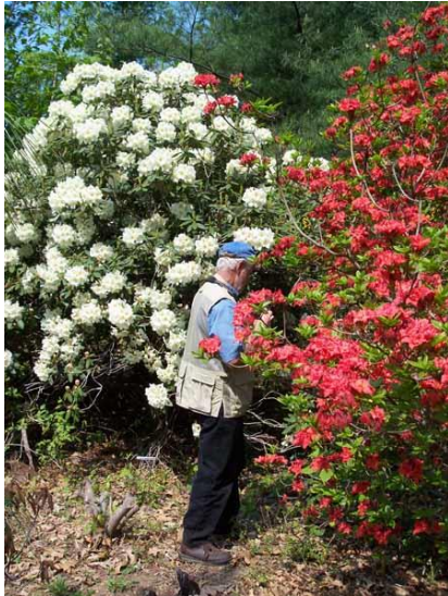
'Crimson Tide' in the garden