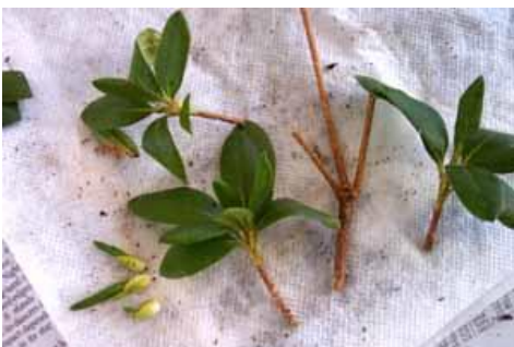
Dormant Cuttings from a broken branch

Don't let those broken branches go to waste. Even if you don't have broken branches, try rooting some cuttings. It is as easy as starting seeds!