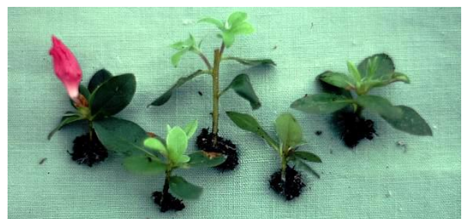
Cuttings break dormancy, sending out new roots and shoots