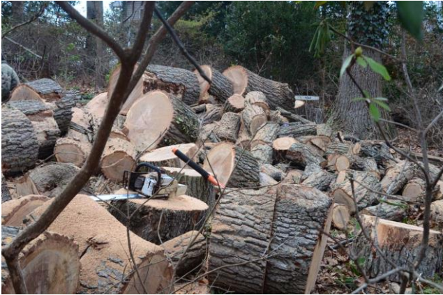
Tree Removal – Broken Branches Can Be Dormant Cuttings

We may not have had heavy snow in the DC area this winter, but the damage from falling branches during wind storms has resulted in lots of damaged plants. I felt fortunate that I had my largest oak tree taken down in January before that terrible March nor'easter. It died at the end of the summer, and I wanted it down before it took out my house or me. It was huge, maybe 80 to 100 ft tall. The arborists tried to avoid other plants, but a number of azalea and rhododendron branches were broken. If you find broken branches in your garden, don't throw them away. Try rooting some as dormant cuttings.