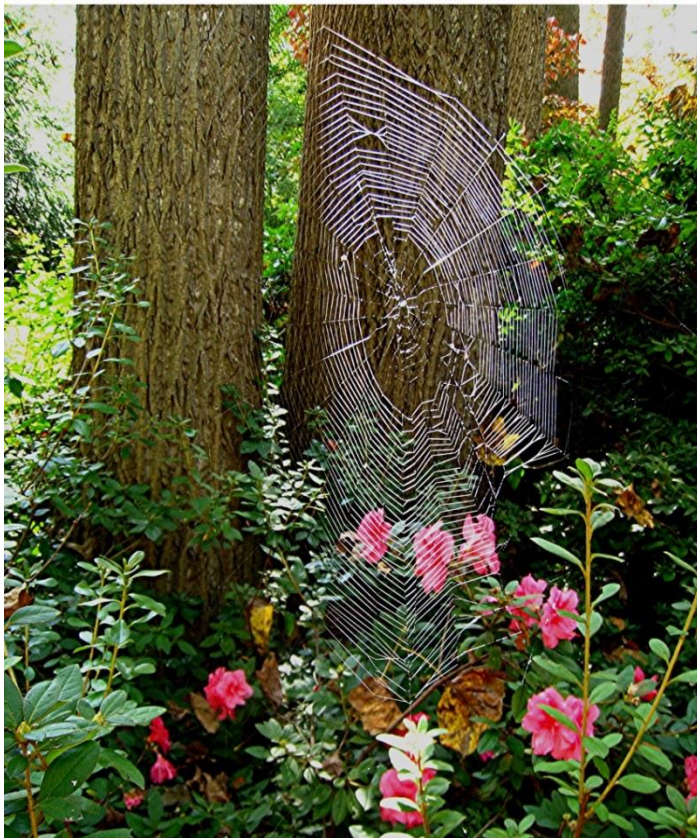
1 st Category III - Best in Contest : Rosa McWhorter “Rosa’s Web Site”