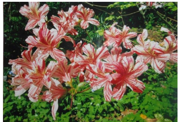
2 nd (tie) Category I: Diane Reinke “Cinderella”