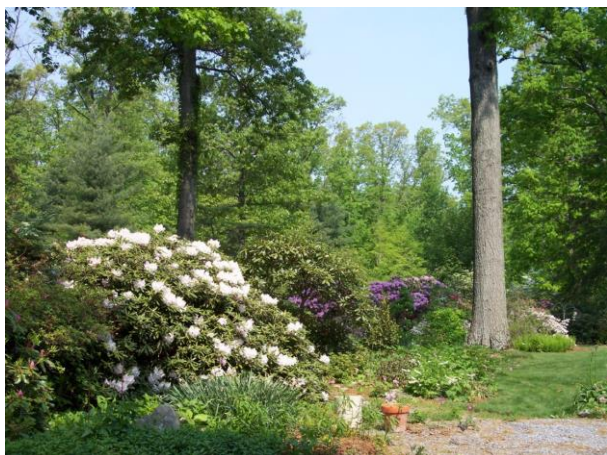
'Mistmaiden' in the Reiley Garden

Ed also had about 500 of his seedlings growing in lath houses that he was evaluating. I remember being there one day as he picked blossom after blossom from different seedlings that all came from the same cross to show me the subtle differences. I think one of the parents was 'Janet Blair' but I don't recall the other. It might have been 'Evening Glow' or some other yellow since the blossoms were large and ruffled in a blend of light yellow and pink. Some had a blotch and others did not. Four of them are pictured below. It would be difficult to select the best since they were all lovely. Ed wanted to wait to see which plants were good growers, too.