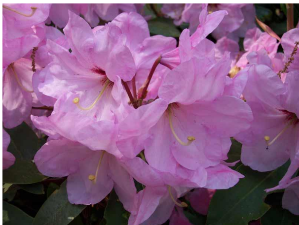
A seedling from the cross ( fortunei x Caractacus )

I remember Ed pointing out an area which had some plants he grew from seed of the cross ( fortunei x 'Caractacus'). They were all fragrant pastels in variations of pink and lavender, usually with a dark blotch. They made a wonderful landscape grouping. The plants were handsome with large, glossy leaves. Ed and Mary registered several from that cross: 'Reileyridge Sweet Sue', 'Reileyridge Target', 'Luscious Lora', and 'Mary's Choice'.