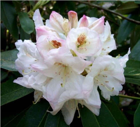
'Carol's' Super White'