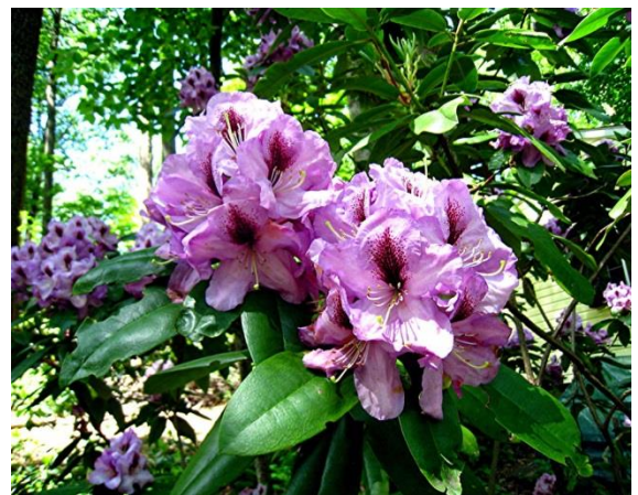
2 nd (tie) Category I: Rosa McWhorter “A. Bedford at Its Best”