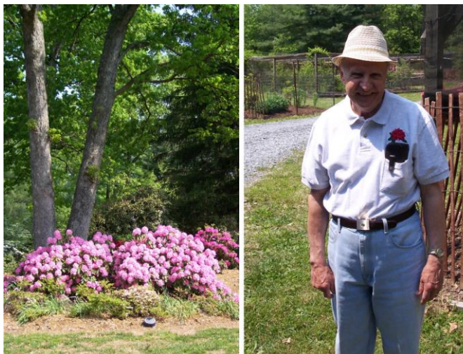
'Wheatley' in the Reiley Garden