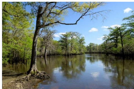
Scenic Vista in the Wild