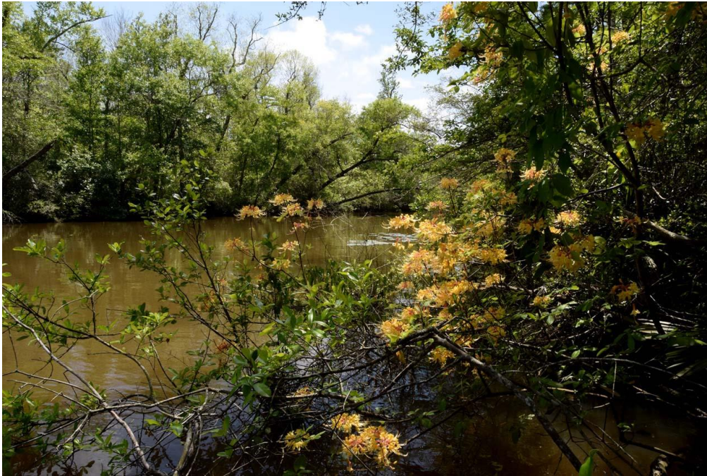
Yellow R. austrinum in the Wild along a Florida River

Zoom Presentation: January 30, 2022 at 2:00 PM