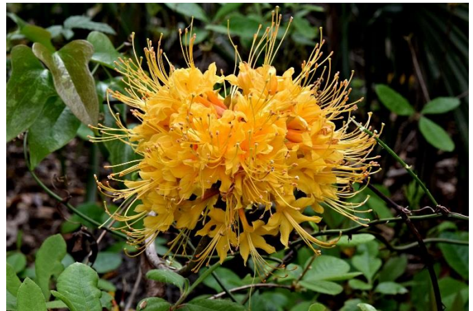
Rhododendron austrinum

Ralf lives in Offenburg, Germany, but he has made many trips to study our native azaleas and rhododendrons in the Eastern United States. He has traveled extensively with Ron along remote rivers in Florida to photograph this lovely and fragrant species. Much of this region is a wilderness area and only accessible by boat. There are more details and images on the next page. Please join us!