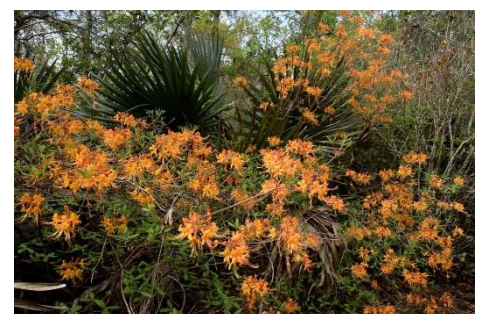
Orange R. austrinum