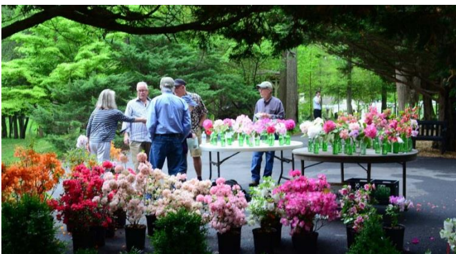
Chapter Flower Show and Plant Sale in 2019