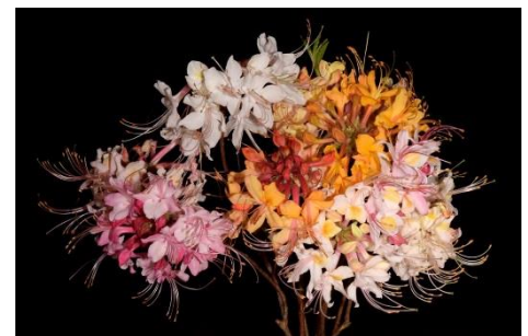
R. austrinum Color Variations