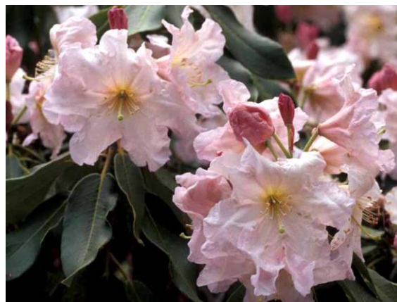
‘Dexter’s Honeydew’

Flowers vivid yellow with vivid orange yellow blotch, tubular funnel-shaped, wavy-edged lobes, 1¾" across. Held in lax truss with 14 flowers. Blooms midseason. Leaves dull green above, with discrete hairs below. Grows to an approximate height of 6 ft. in 10 years. Plant and bud cold hardy to at least 10°F (-12°C). Hybridized by Aromi.