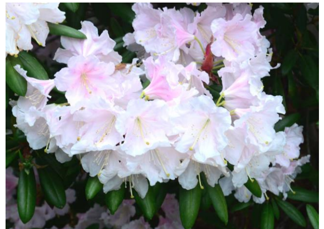
Rhododendron ‘London Town’