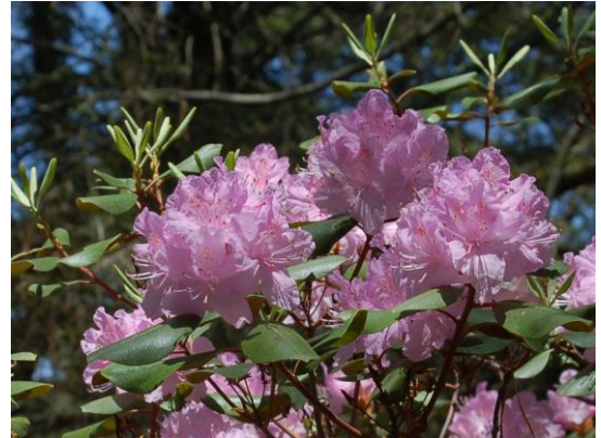
R. carolinianum

Flower vivid purple, no markings, openly funnel-shaped, flat-edged lobes, 1 \frac{2}{3} " across. Truss holds 3-9 flowers. Blooms early season. Leaves elliptic, 1 \frac{1}{8} " long, semi-glossy, moderate to light yellow-green, scaly below. Typical height: 2 \frac{1}{2} feet in 10 years. Dense growth habit. Hardy to at least -8°F (-22°C). Anderson Hybrid.