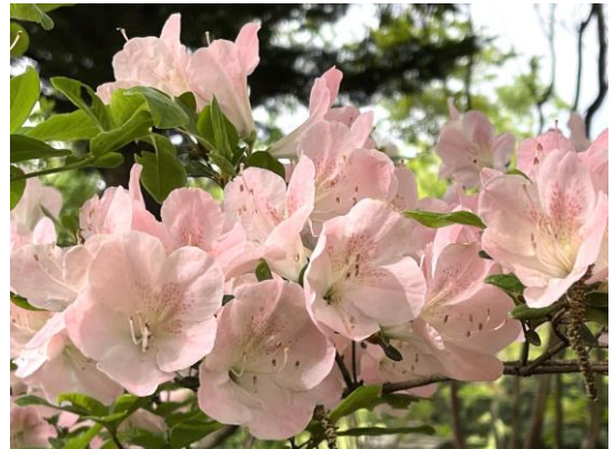
'Pocono Pink'

Selected, named, and introduced by Nancy Swell in 1979 from a group of unlabelled plants at Pocono Nursery in Virginia. Flowers single, 2 per bud, funnel-shaped, 40 x 52mm, light to pale purplish pink, slightly tinged with a light pink shading to white at base; blotch pale yellow with light yellow red spotting over pink ground. Leaves strong yellow-green. Shrub 1.2m in 10 years. Mid May.