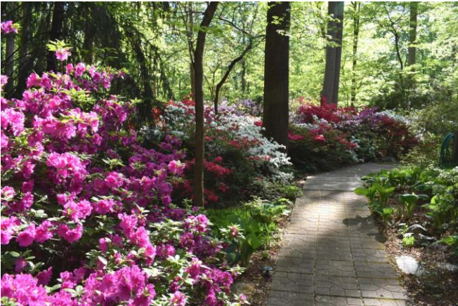
Tour 1: London Town & Gardens