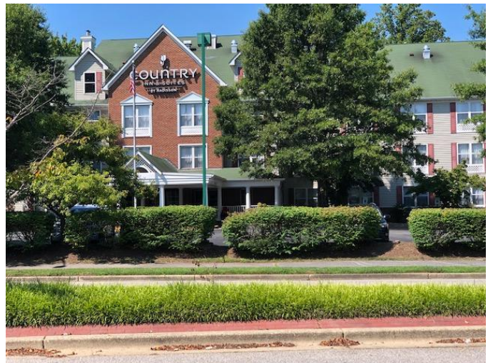
Country Inns & Suites - Annapolis

We have set up a website which has lots of pictures and more information about our meeting. It has the full schedule, more images of the gardens, meal options, and the registration form. We expect to post the plants we will have in our sale. Check out the link below to see our meeting website: