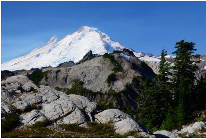
Mount Baker, WA