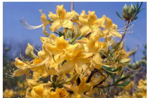
'Admiral Semmes'

One of the most heat and humidity tolerant deciduous azaleas available for southern gardens. A very adaptable plant developed and introduced by the Dodd Nursery in Alabama from a cross between the Florida species R. austrinum and the Knap Hill hybrid 'Hotspur Yellow'. The plant grows rapidly and matures as a large, rounded shrub measuring 5 to 10 ft (1.5 to 3 m). Medium sized flowers measure 2.5-3" long (63-75 mm) and 1.5" wide (38 mm). Flower color is bright yellow with darker blotch, and blossoms are extremely fragrant. Blooms in early May. Leaves are lustrous dark green, mildew resistant, and turn orange-bronze to scarlet before shedding in autumn. Winner of the 2007 Georgia Gold Medal Award.