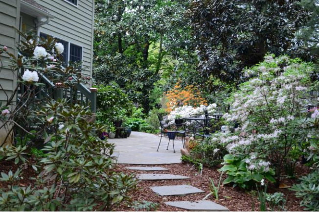
Tour 2: Richard Bradshaw Garden