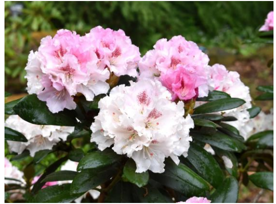
'Ingrid Mehlquist'

Gus Mehlquist hybrid. Flowers pink in bud, opening pale pink, maturing to white with burgundy dots. Leaves elliptic to slightly obovate, glossy dark green and powdery above, puberulent below (hairs pale tan at first, ageing to rusty brown). Compact shrub 0.9 x 1.25m in 25 years. Very resistant to root rot. Blooms in May.