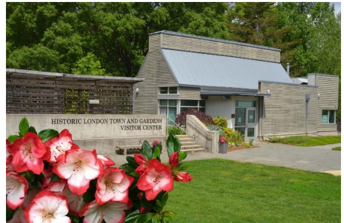
London Town & Gardens, Edgewater, MD

Please register early. The hotel has set aside a block of 25 rooms for our event until March 31, our registration deadline. Due to restrictions at the hotel and other venues, we have to limit attendance so our target range is from 50 to at most 70 persons. This will be a rare opportunity to renew old friendships and make new friends as we admire some lovely gardens.