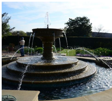
NBG Formal Fountain