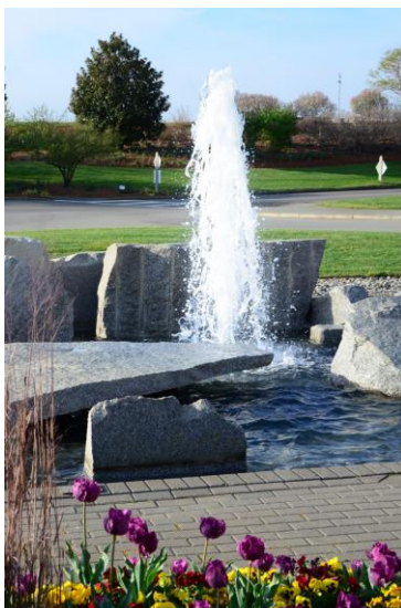
Pond and Fountain Norfolk Botanical Garden