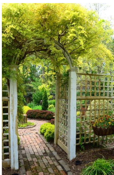
Arbor Structure Pinkham Garden

As Don discusses varying artistic tastes, he will show gardens with impressive hardscapes including arbors, patios, garden walls, and water features. He will share accents he has admired over the years including sculptures, innovative containers, garden signs, and more. Don has always valued humor so expect to see some whimsical landscape features, a few that are subtle but others that are bold and outlandish. Expect a few amusing stories from the past, too.