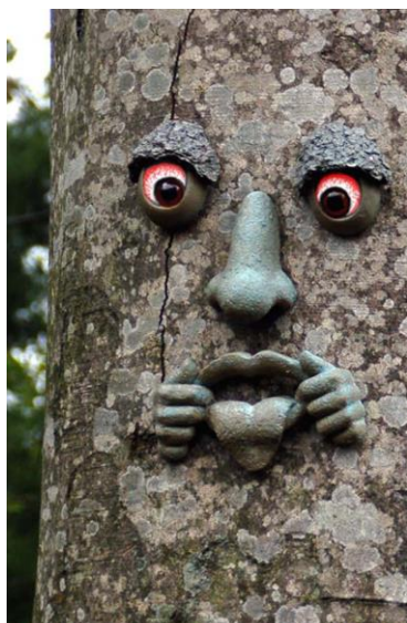
Whimsical Tree Paul James Garden