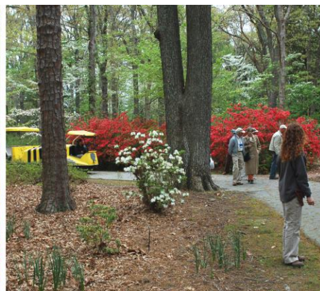
Shuttle to Azalea Woods