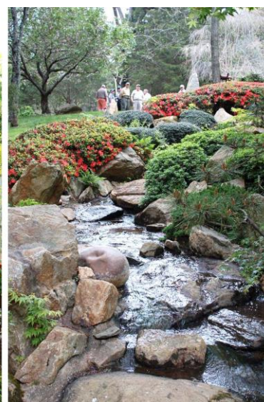
Waterfall Liesfeld Garden