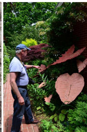
Leaf Castings Elissa Steve's Garden