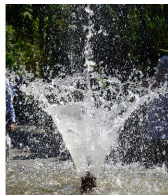
Victoria BC Fountain