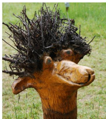
German Root Sculpture