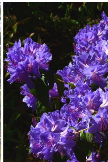
Karel Bernady with June Sinclair's R. augustinii

I wish I could grow R. augustinii . It is a tall plant that can reach 6 to 8 ft or more and is very impressive with flowers that can measure up to 3" across. The color typically ranges from shades of light to medium blue and purplish hues. It has trouble in our climate but there are some hybrids of it we can grow. One of the best is 'Blaney's Blue' which is a good deep blue, and 'Rhein's Luna' which is a lighter lavender blue.