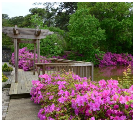
Azaleas at Water's Edge